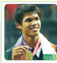
Somdev Devvarman India's First tennis golds medallist in the Commonwealth Games