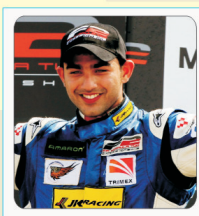
Armaan Ebrahim Car Racing - Formula-I