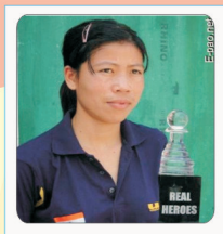
MC Mary Kom Winner of Bronze Medal of LONDON Olympics -2012