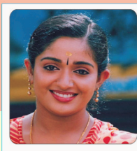
Kavya Madhavan Kerala's Leading Actress State Award Winner