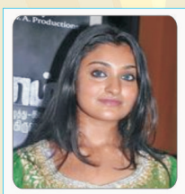
Jai Quehaeni Professional Bharatanatyam dancer & Tamil Film Actress