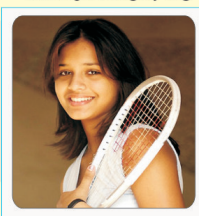
Dipika Rebecca Pallikal Professional Squash player 13th Rank Holder